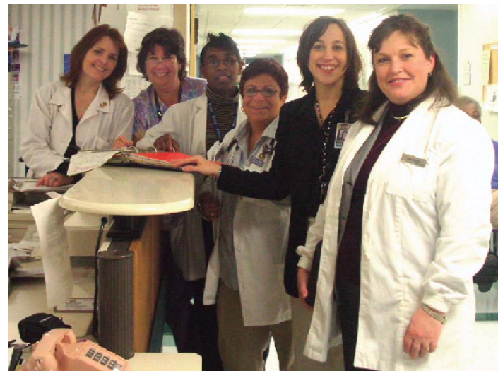
The Taylor Care Center Team

1999 - % Prevalence Patients Nosocomial was 54% 2004 - % Prevalence Patients Nosocomial decreased 17%